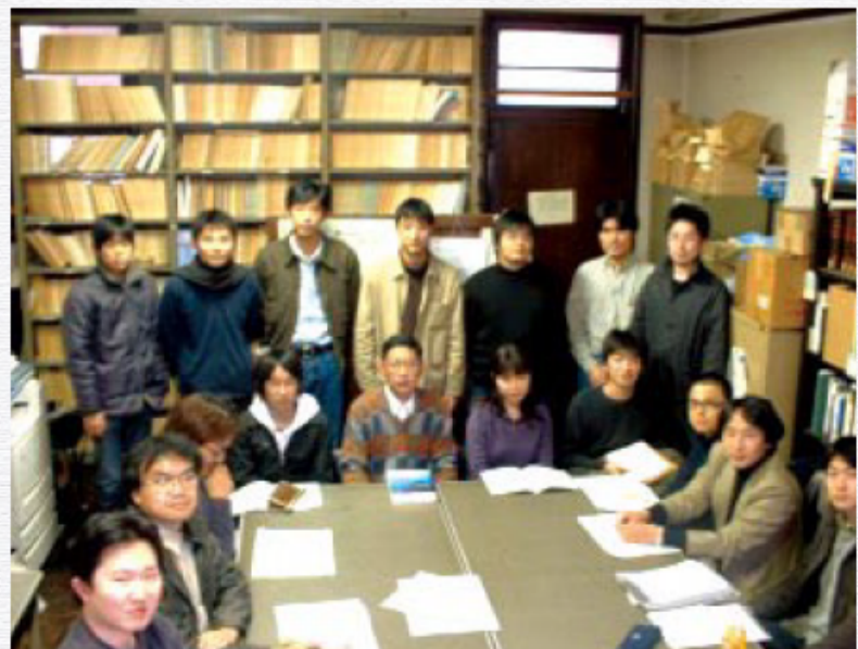
L: A former professor Kitaro Nishida M: Another former professor Hajime Tanabe R: A scene of the graduate student seminar